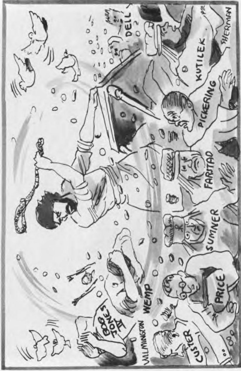
CLEANSING THE TEMPLE: OR "DEN OF THIEVES"